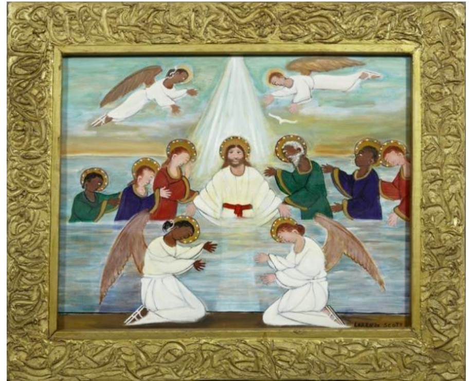
The Baptism of Jesus, Lorenzo Scott (b. 1934)