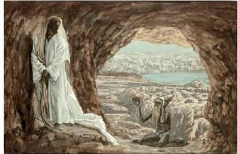
Temptation in the Desert (James Tissot, 1836-1902) Brooklyn Museum

St. Luke's Episcopal Church 219 Chunns Cove Road Asheville, NC 28805